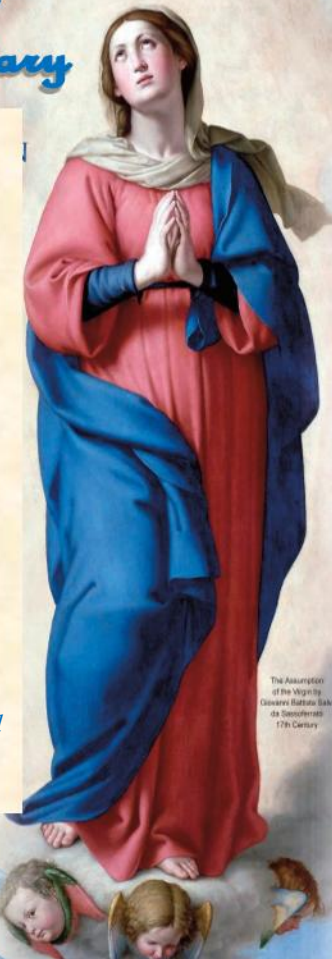
The Assumption of the Virgin by Giovanni Battista Gaulli de Tiaroli 17th Century