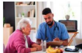
Caregiver Engaged ~ Companion By Choice

Holy Spirit Parishioner Family - 4 Generations | 301 E. Ocean Avenue, Suite #3, Lantana, FL 33462 | 561-340-3304 Private Pay | Long Term Care Provider | VA Aid & Attendance Companion Benefit Program