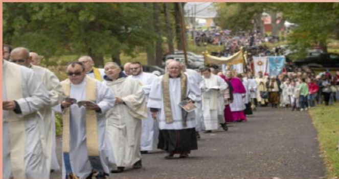
Priests walk in a Eucharistic procession Oct. 21, 2023, at the Shrine of Our Lady of Martyrs in Auriesville, N.Y., during the New York State Eucharistic Congress Oct. 20-22. Participants in the National Eucharistic Congress and related National Eucharistic Pilgrimage will have opportunities to receive plenary indulgences, Archbishop Timothy P. Broglio, president of the U.S. Conference of Catholic Bishops, announced April 9, 2024.

JULY 17-21, 2024 LUCAS OIL STADIUM INDIANAPOLIS, INDIANA